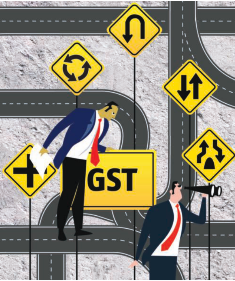
ILLUSTRATION: BINAY SINHA

First, the announcement of two GST slabs with special rates for 'sin' goods is welcome, but what should the slab rates be? It is suggested that the twin slab rates should not be 5 per cent and 18 per cent, but 8 per cent (the average of the current two merit rates of 5 per cent and 12 per cent) and 18 per cent. The reason for this is that a higher merit rate would enable the government to integrate GST rate rationalisation with trade policy. In the trade negotiations, the government is seeking greater market access for products of labour-intensive manufacturing industries like textiles, leather, food processing, and toys. Logically, these industries must be brought under the merit rate of GST. At the 5 per cent rate, there would be an accumulation of input tax credit (ITC), especially the utilisation of the integrated goods and services tax (IGST) credits of imported inputs. At 8 per cent, with reasonable value addition, the accumulation of credit problems would be less pronounced, but how does the government counter the public perception about increasing GST rates? To resolve this, it is suggested that the government introduce a 1 per cent/2 per cent rate, which could be called the clearing rate or the concessional rate. This will serve a number of purposes. The government can bring items it does not want to move to 8 per cent from 5 per cent into the lower rate category. Importantly, the 1 per cent to 2 per